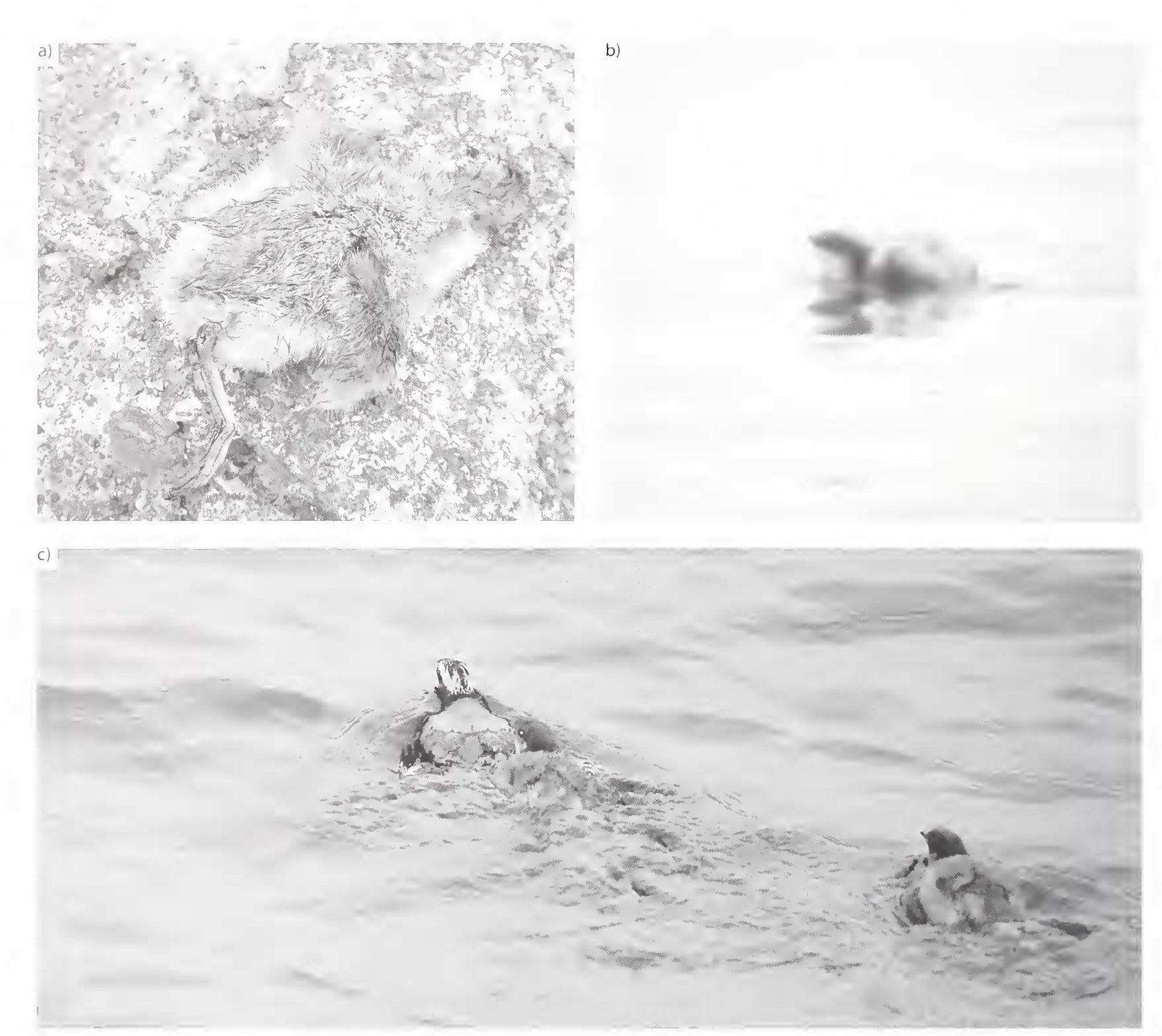
Figure 2. Japanese Murrelet: (a) a dead chick found on Dok Island on 28 May 2005; (b) a chick on Jeju Island on 29 April 2011; and (c) an adult and two juveniles on Jeju Island on 25 May 2011.

of Jeju Island: one individual in May 2006, five in March and 14 in May 2007 (Kim 2008); ten in April and seven in May 2008 (Kim et al. 2010); one in April and five in May 2009 (CWK); one in April and two in May 2010 (CWK); and five in April and three in May 2011 (DWK).